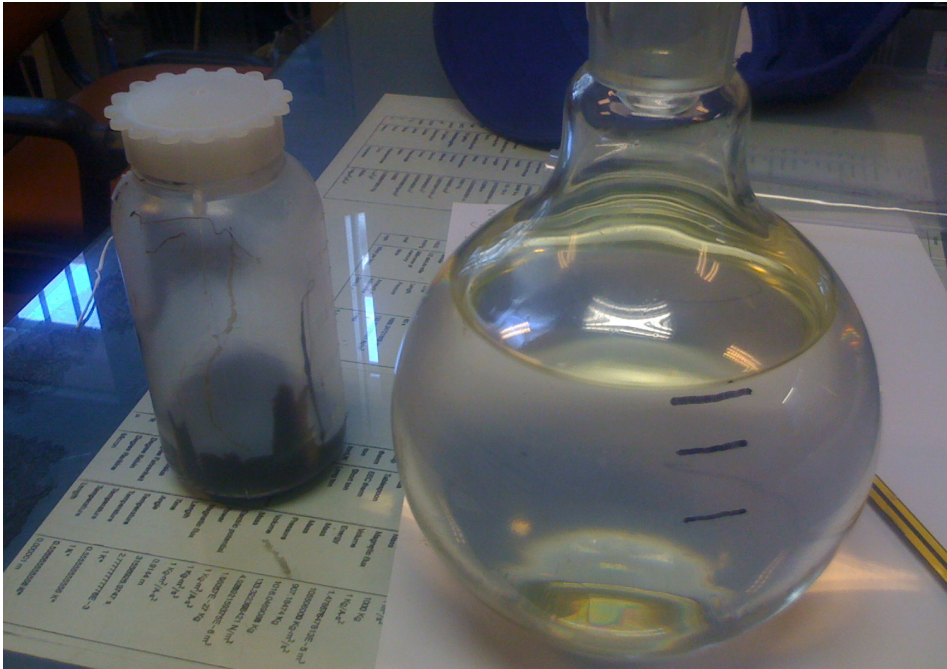
Residual product and purified solvent for recycling.